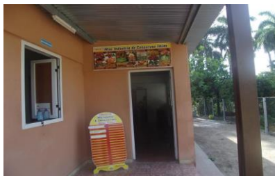
Image 1. Jesus Lores mini-industry, Imías

Introduction of an innovative technology for mini industries, which makes the production process more efficient, in addition to humanizing the work of the operators. Production increased from 2 tons per month before the project to 4 tons in the same period.