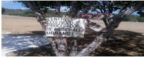
Image 3. Ecological area for solid waste processing