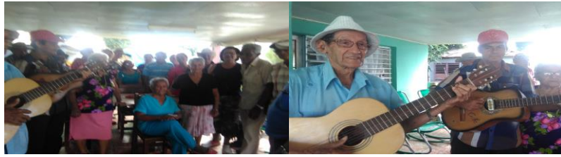
Image 5. Municipal grandparents' home