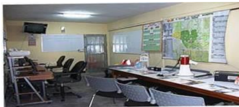
Image 4. Municipal Risk Management Center

General Objective: Strengthen municipal management processes for participatory environmental disaster risk reduction as a contribution to the sustainable development of the municipality.